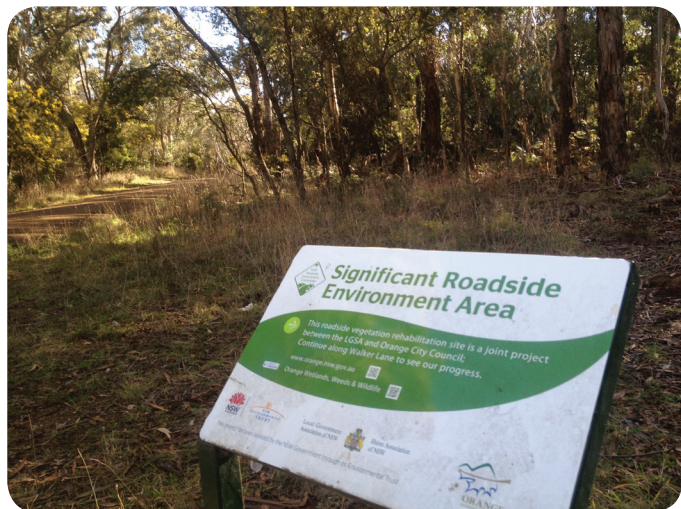
Example of a Significant Roadside Environment Area sign

Roads are regularly used by everyone in the community. Placing signs on roadsides will create interest in the roadside environment. Signs also alert roadside users and works crews to areas which need special care particularly those high priority sites within high conservation value roadsides.